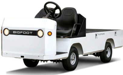
Bigfoot Our flagship burden carrier with big payload and big towing.