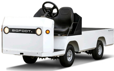
Bigfoot S Compact footprint with tighter turns for smaller facilities.