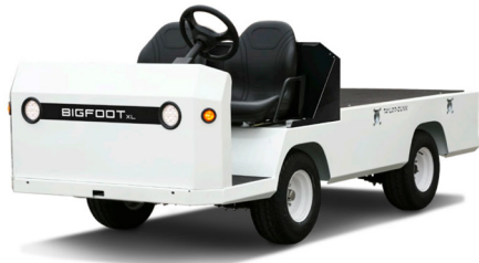
Bigfoot XL Maximum towing for larger operations.

If you need a tailored solution, our product and engineering team will work with you to design a custom vehicle. With possibilities ranging from special paint colors to major frame modifications, our custom vehicles are manufactured with the same craftsmanship, quality, and care as our standard models.