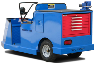
MX-600 The ultimate maintenance cart for indoor and outdoor applications.