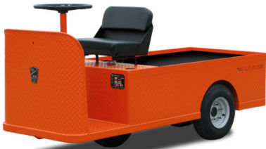
C-432 Narrow aisle utility vehicle for the tightest of spaces.