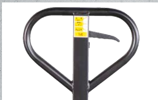
Teardrop handle with 3-way position lever for load control