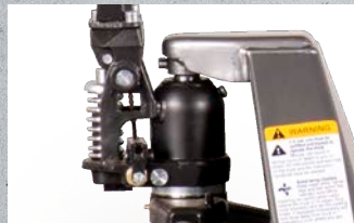
Hydraulic pump with over-load bypass valve