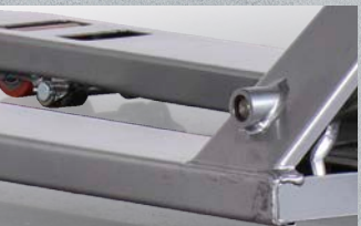
Durable powder coat paint finish